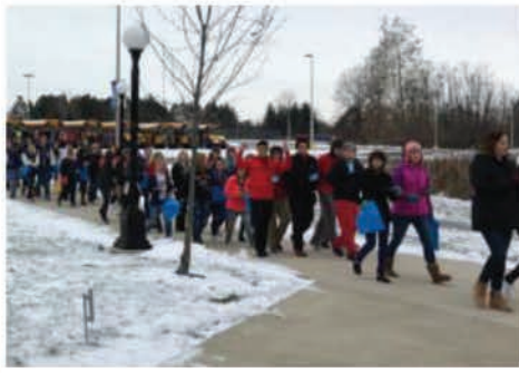
Over 1,500 High School students participated in Career Day on Friday, December 16; fourteen alumni served as career presenters