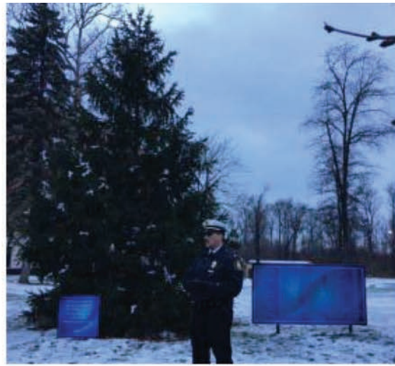
Criminal Justice Memory Tree - Area law enforcement and corrections officers gathered to honor 135 (to date) Criminal Justice Officers and K-9 who lost their lives in the line of duty during 2016 in the United States