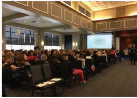
On Career Day, hundreds of students learned how Rhodes State College can provide a path toward a Bachelor Degree, in addition to an Associate Degree