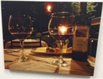
Candlelight & Wine mounted photo by Jerry McGlothen