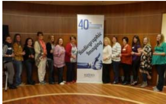
Radiographic Imaging alumni gave a "thumbs up" for the anniversary celebration. Click here to view the highlights video of the event.