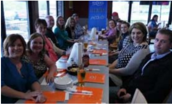
Alumni and guests gathered at Lima's Buffalo Wings & Rings(c) for a chance to reconnect.